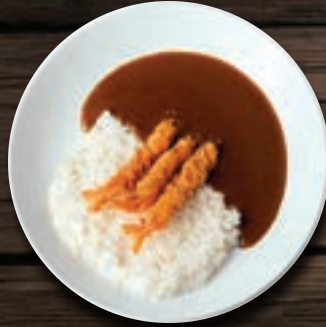
JUMBO SHRIMP KATSU CURRY