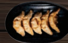
BEEF GYOZA $4.95