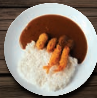
SEAFOOD MIX KATSU CURRY