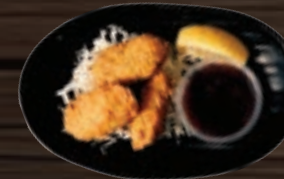
FRIED OYSTER $4.95