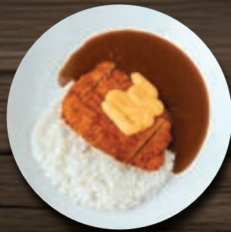
JAPANESE CHEESE PORK KATSU CURRY