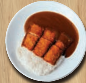
SALMON KATSU CURRY