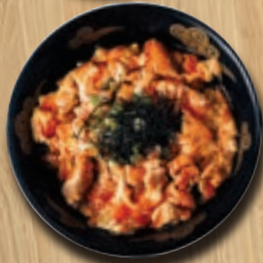
KARAI OYAKODON $10.95