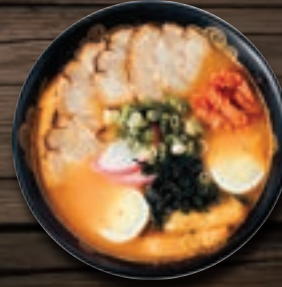
SPICY TONKOTSU UDON $11.95