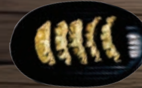
VEGGIE GYOZA $4.95