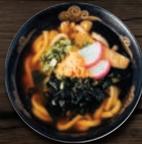
KAKE UDON $9.95