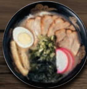
TONKOTSU UDON $11.95