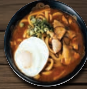
CURRY UDON $11.95