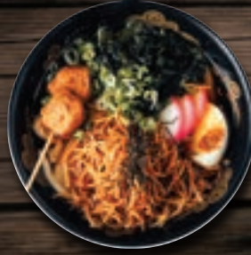
CURRY YA UDON $14.95