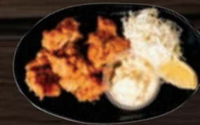
CHICKEN KARAAGE $4.95