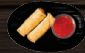
EGG ROLL $4.95