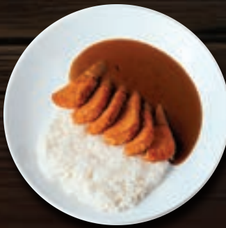
SPAM KATSU CURRY