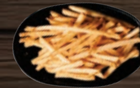
FRENCH FRIES $4.95