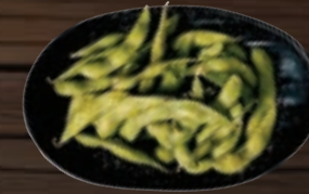
STEAMED EDAMAME $4.95