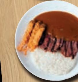
SURF & TURF CURRY