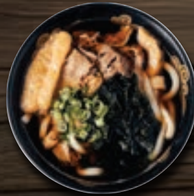
BEEF UDON $10.95