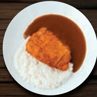
ORGANIC CHICKEN KATSU CURRY