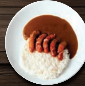
KUROBOTA SAUSAGE CURRY