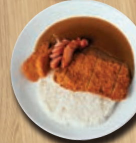
MEAT LOVER CURRY