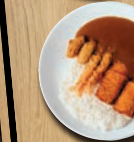
SEAFOOD LOVER CURRY