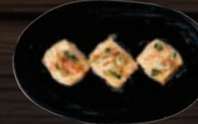
AGEDASHI TOFU $4.95