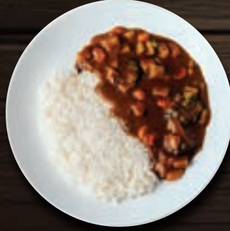
MIX VEGGIE CURRY