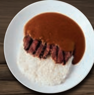
RIBEYE STEAK CURRY