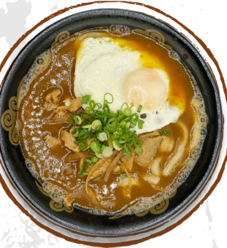
CURRY UDON カレーうどん