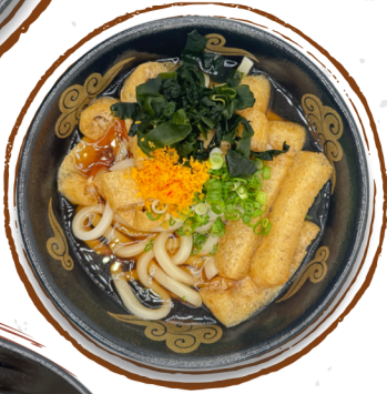
KAKE UDON かけうどん