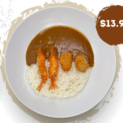
JUMBO SHRIMP KATSU CURRY