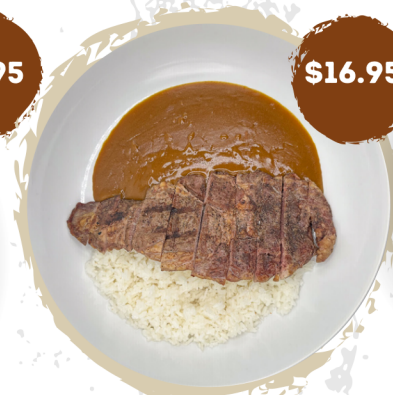
JAPANESE CHEESE PORK KATSU CURRY