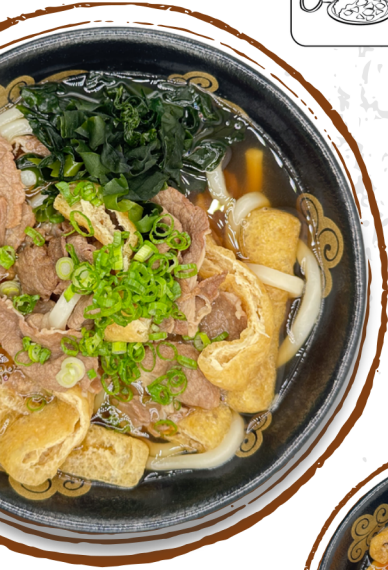
BEEF UDON 牛肉うどん