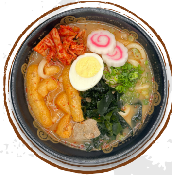
SPICY TONKOTSU UDON ピリ辛とんこつうどん