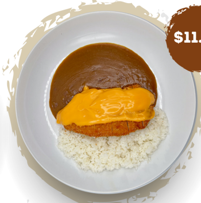
JAPANESE PORK KATSU CURRY